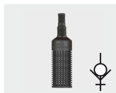
Filter with check valve. Plastic. Stainless steel weight