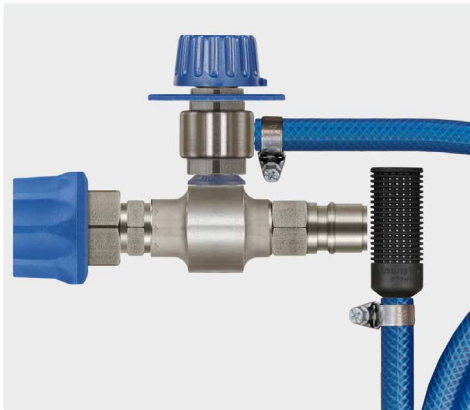
Coupling ST-45-250 stainless steel : plug ST-45-250 stainless steel. Injector with metering valve ST-161, suction hose 2,000 mm and suction filter ST-31. Max. 250 bar / 90 °C