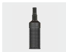
Filter without check valve. Plastic. Stainless steel weight