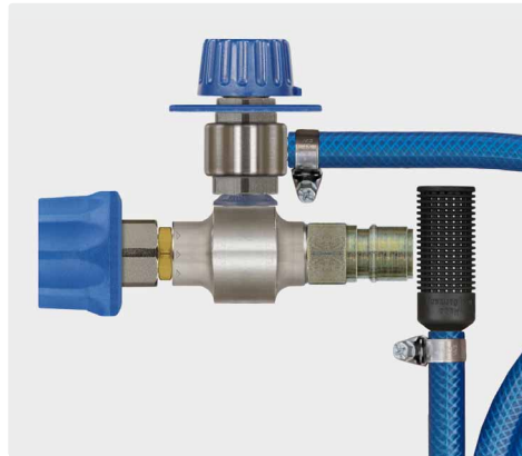
Coupling ST-45-250 nickel-plated brass : plug ST-45-250 zinc-plated steel. Injector with metering valve ST-161, suction hose 2,000 mm and suction filter ST-31. Max. 250 bar / 90 °C