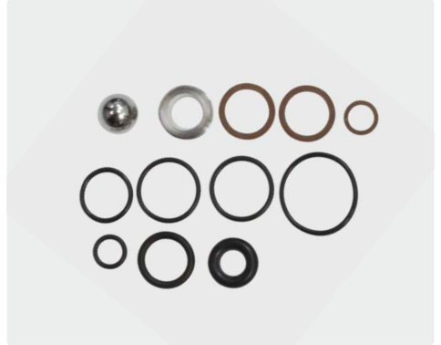
Rep. Kit VB85