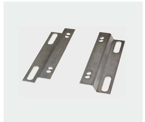
Adjustable feet for pumps incl. 4 screws. For Annovi Reverberi XM, XMS, XMA, RK, RKA