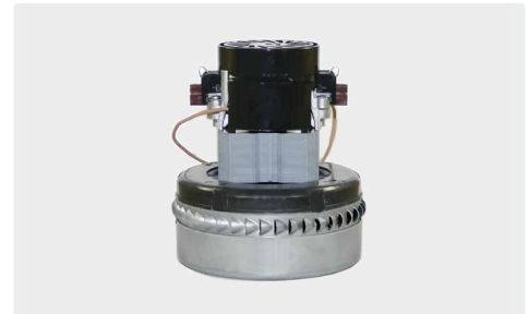
2 stage. 230 V / 50 Hz. Cable pre-installed