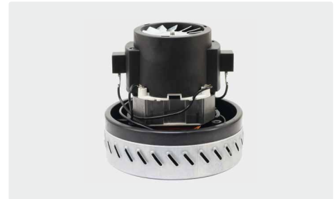
1 stage. 230 V / 50 Hz. Cable pre-installed