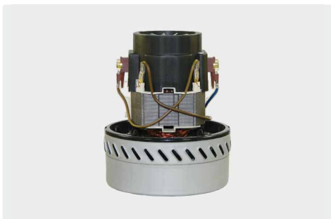
2 stage. 230 V / 50 Hz. Cable type 2 enclosed