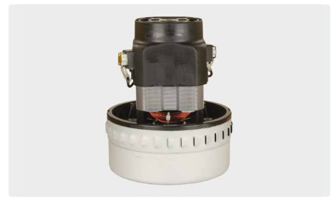
2 stage. 230 V / 50 Hz. Cable pre-installed. TYP Universal