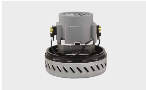
1 stage. 230 V / 50 Hz. Cable type 2 enclosed