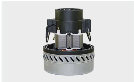
2 stage. 230 V / 50 Hz. Cable type 3 enclosed