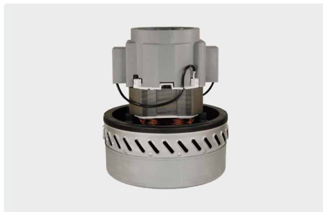
2 stage. 230 V / 50 Hz. Cable type 2 enclosed