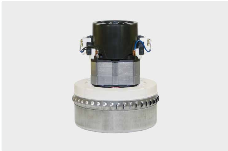
2 stage. 230 V / 50 Hz. Cable type 1 enclosed