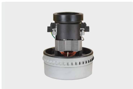
2 stage. 230 V / 50 Hz. Cable pre-installed