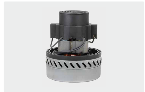
2 stage. 24 V. Cable pre-installed