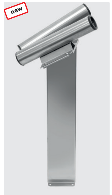
Double crevice nozzle holder on column incl. adapter plate. Stainless steel