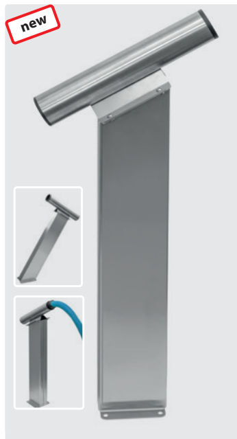
Crevice nozzle holder on column for floor mounting. Stainless steel