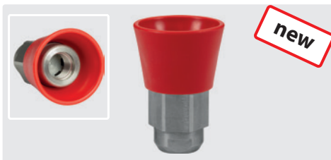
ST-78. Stainless steel

Disinfection, humidification, cooling, dust suppression, decontamination, odor control in agricultural, food and construction industry, defence and firefighting technology, car washing and detailing