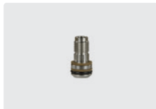
Repair kit ST-311