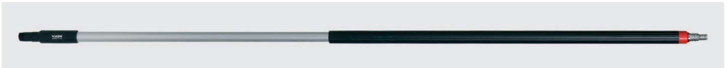
Aluminium handle. Ergonomic handle with insulated grip. Hose tail suitable for 1/2" and 3/4" hose