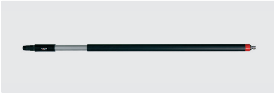
Aluminium handle. Ergonomic handle with insulated grip. Connector suitable for Nito system