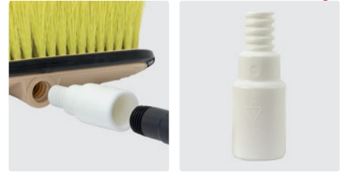
Adaptor for lances without coarse thread. Coarse thread F: thread M