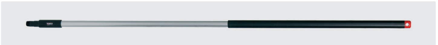
Aluminium handle. Ergonomic handle with insulated grip