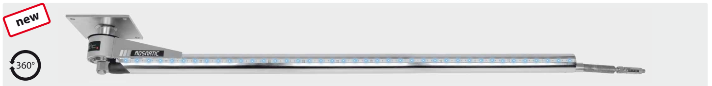
Ceiling boom with ball bearing swivels. Maintenance-free. Connection with swivel