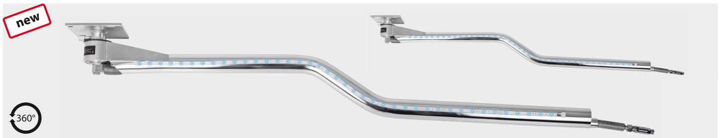
Ready for installation with two integrated swivels. Especially designed for using two booms side by side. Insulated high pressure hose