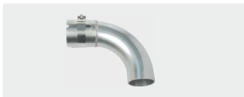
1 pipe clamp