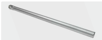
1 pipe clamp. 1,000 mm