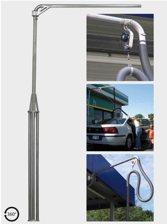
Spinner with a moving radius of 360°. Height 3,100 mm

Air system spinner LU-B for floor fastening