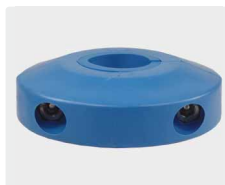
Hose stop with six exchangeable inserts. Hose ∅ 10 - 34 mm