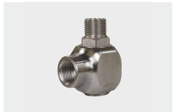
1/2" F : 1/2" M. DN 12. Max. 300 bar / 90 °C