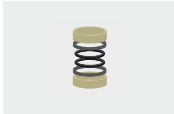
Repair kit swivels ST-322