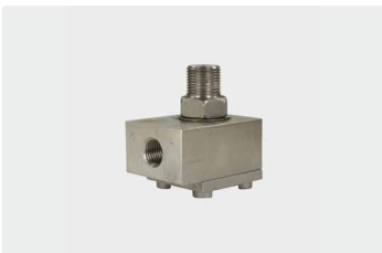
1/4" F : 3/8" M. Housing and axle stainless steel. Max. 600 bar / 90 °C