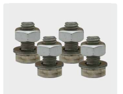
Stainless steel. Set for bracket