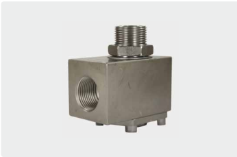
Swivel 200 bar