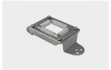
Wall hose guide frame. 50 x 37 mm