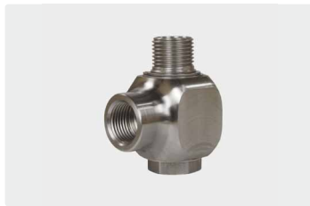
1/2" F : 1/2" M. DN 12. Max. 300 bar / 90 °C