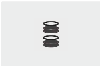
Seal kit swivel 750 280 0