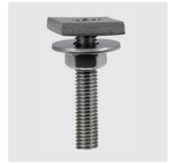
M8 x 30. Stainless steel.