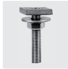
M8 x 30.