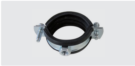
Stainless steel V2A. 1.4301 / AISI 304