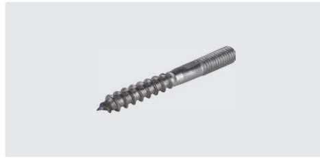
Hanger bolt. Stainless steel. M8 x 80