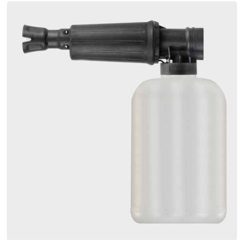
1/4" F. Foam injector lance with regulator and bottle. Max. 300 bar / 80 °C