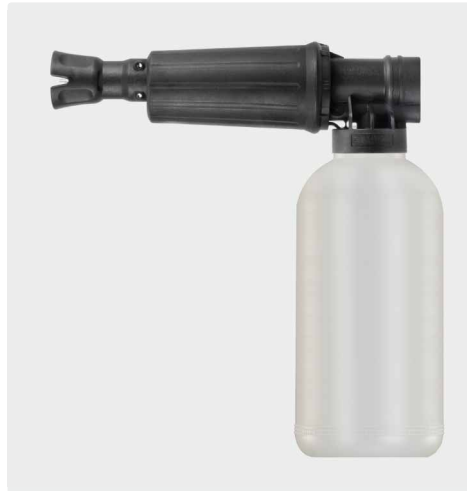
1/4" F. Foam injector lance with regulator and bottle. Max. 300 bar / 80 °C