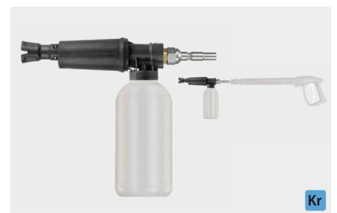
Plug KR. Foam injector lance with regulator and bottle. Max. 300 bar / 80 °C