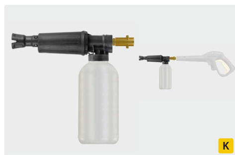
Bayonet K. Brass. Foam injector lance with regulator and bottle. Max. 300 bar / 80 °C