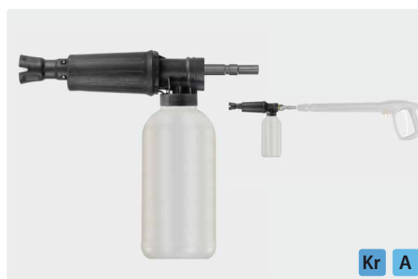
Plug KW. Foam injector lance with regulator and bottle. Max. 300 bar / 80 °C