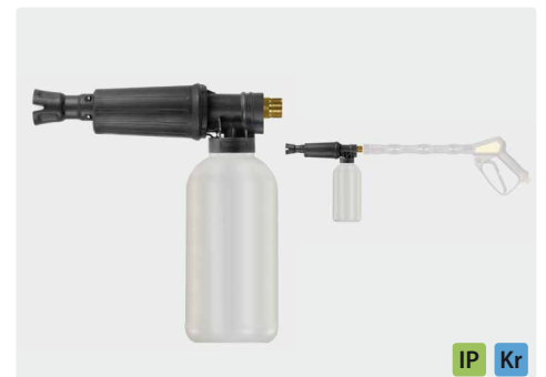
M22 M. Foam injector lance with regulator and bottle. Max. 300 bar / 80 °C