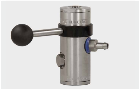
easyfoam365+ bypass injector ST-167 with hose tail 9 mm