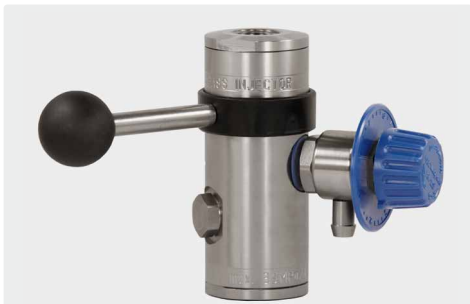
easyfoam365+ bypass injector ST-167 with metering valve ST-161 and hose tail 9 mm