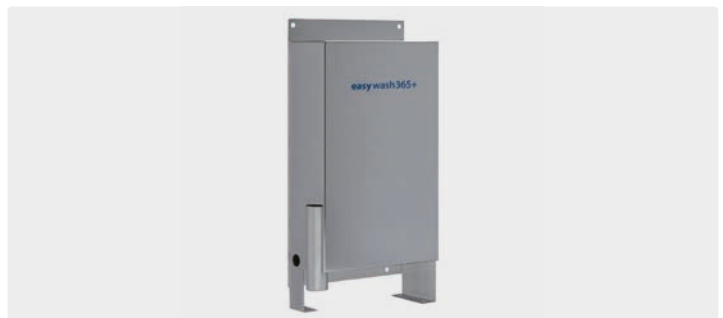
Container with overflow and lateral drain for cleaning. For wall and floor mounting. H x W x D = 670 x 340 x 143 mm