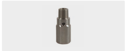
1/4" M : 1/4" F. Flow at 100 bar