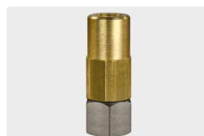
1/4" F : 3/8" F. easywash365+ guns