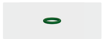
O-ring. 10x2. Viton