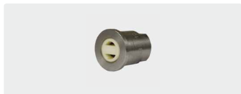
Air injector nozzle