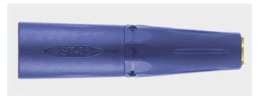
Brass. ST-75.1 without nozzle and without foam pad. Max. 350 bar / 60 °C