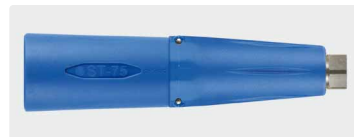
Stainless steel. ST-75.1 with nozzle and without foam pad. Max. 350 bar / 60 °C