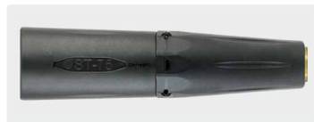
Brass. ST-75.1 without nozzle and without foam pad. Max. 350 bar / 60 °C