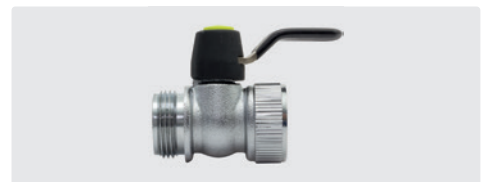
Ball valve. 3/4" F : 3/4" M. Brass