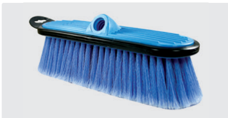
Bristles 60 mm. Soft. 250 x 80 mm