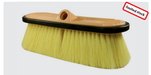
Bristles 60 mm. Hard. 250 x 80 mm