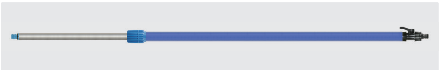
Telescopic lances with coarse thread. Telescopic handle with water flow