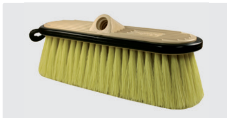
Bristles 60 mm. Hard. 250 x 80 mm