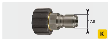
Plug : F. Stainless steel + brass. Max. 250 bar / 150 °C