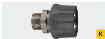
Coupling : M. Stainless steel. Max. 250 bar / 150 °C