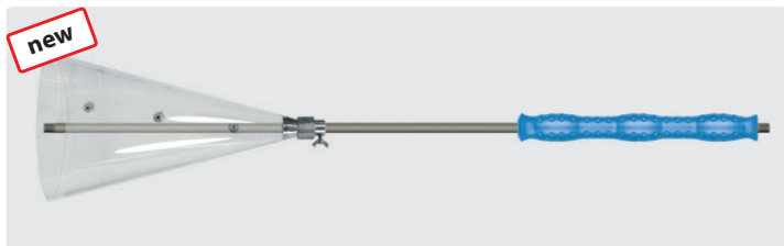
Lance with insulation ST-29 Cool & Compact. Pleasantly ergonomic shaped handle. Closed surface. With splash guard, adjustable with thumbscrew. Max. 400 bar / 80 °C