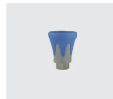
Plastic. Stainless steel