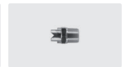
1/2" M NPT. Stainless steel. Foam nozzle