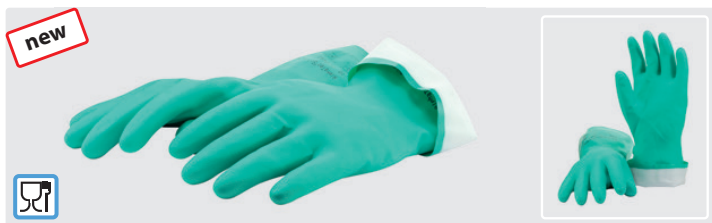
Category III -Protection Glove AlphaTec® Solvex®37-675. Very durable nitrile glove for use with hazardous chemicals. The reversed lozenge finish further enhances levels of grip. Cotton-flock liner to the glove