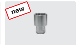
1/4" F NPT : 3/8" F. Stainless steel. Socket