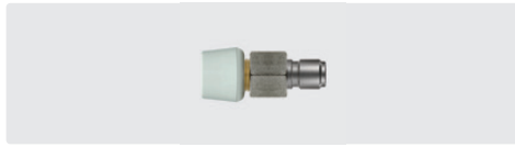
Plug ST-3100 with foam nozzle 50° 200