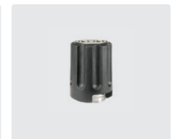
2 x 1/4" F : 1/4" F. ST-58 change-over valve. Max. 350 bar / 45 l/min