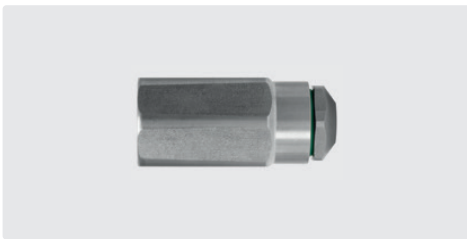
3/8" F : 1/4" F. Stainless steel. Nozzle head without nozzle