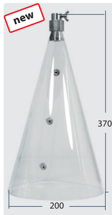
PVC splash guard, with thumb screw adjustable stainless steel holder for attachment to lances. Max. 80 °C