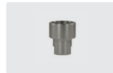
1/4" F : 1/4" F. Stainless steel. Socket