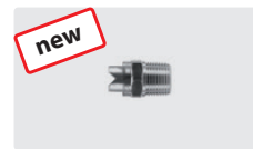
1/2" M BSP. Stainless steel. Foam nozzle