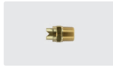
1/2" M. Brass. Foam nozzle