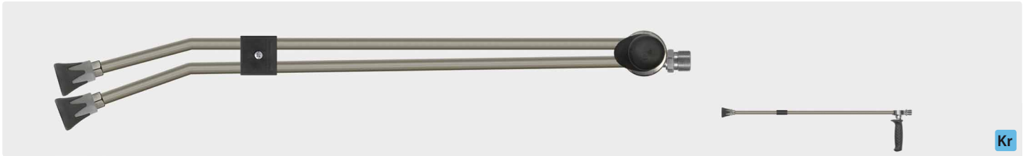
M22 M. Lance with valve ST-54.2 aside and nozzle protector ST-10 with low pressure nozzle. Max.400 bar / 150 °C