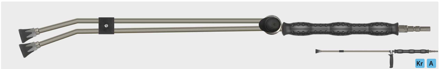
Plug KW. Lance with moulded handle ST-29 Cool & Compact, valve ST-54.2 aside and nozzle protector ST-10 with low pressure nozzle & thread 1/4" F. Max. 400 bar / 150 °C