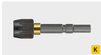
Nozzle protector with M22 F. Without tip. Max. 400 bar / 150 °C