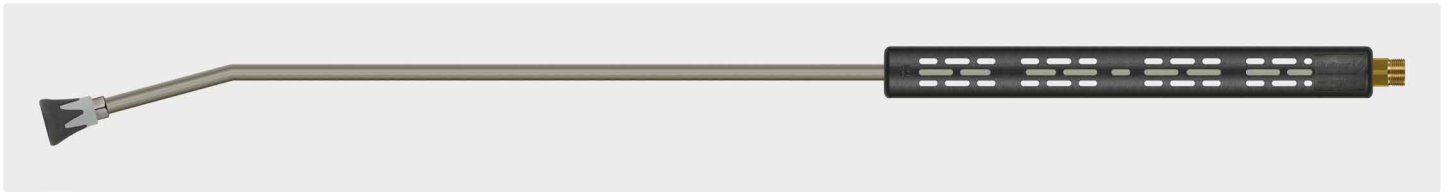
M22 M. Lance with vented handle ST-9 and nozzle protector ST-10 without high pressure nozzle. Max. 400 bar / 150 °C