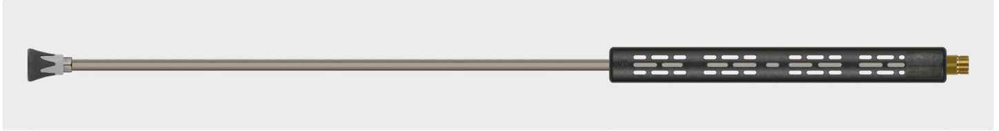
M22 M. Lance with vented handle ST-9 and nozzle protector ST-10 without high pressure nozzle. Max. 400 bar / 150 °C