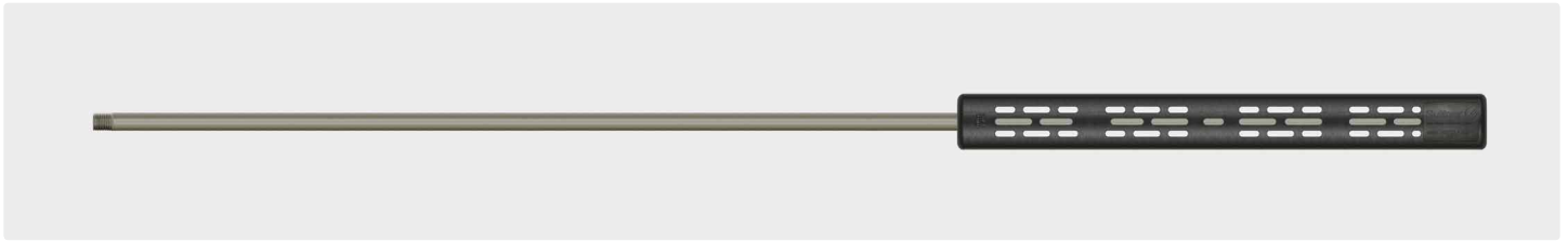
Lance with insulation ST-9. Max. 400 bar / 150 °C