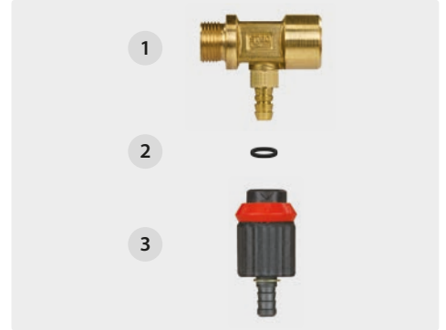
Min. 2 bar - max. 10 bar. Output of approx. 150 l/h at 2 bar. Mixing of chemicals approx. 0 - 11.5 %