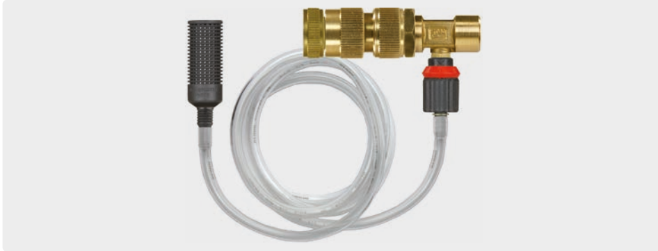
Injector with metering valve. Suction hose 1,000 mm. Suction filter ST-31. 2 bar - max. 10 bar