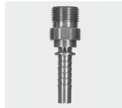
Stainless steel. Flat sealing