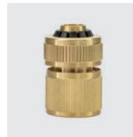
Brass. With tension screw