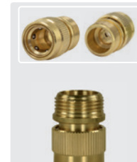
3/4" M thread. Brass