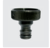
F thread. Plastic. With flat seal