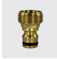
M thread. Brass