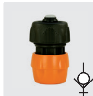
Plastic. With tension screw + water stop