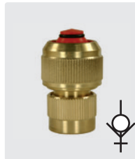
Brass. With tension screw + water stop