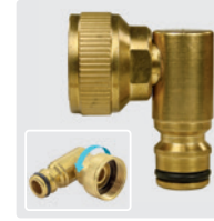
F thread. Brass. Elbow swivel. With flat seal