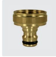
F thread. Brass. With flat seal