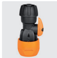
Plastic. With tension screw + stop valve