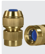
Brass. With tension screw

Premium quality. Hose couplings with 6 stainless steel balls.