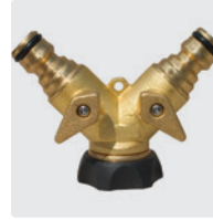
F thread. Brass + rubber. Double exit