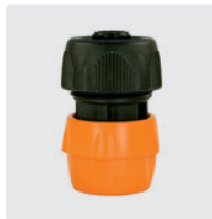
Plastic. With tension screw