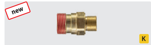
3/8" M : TR22 M. Brass. Max. 400 bar / 150° C.