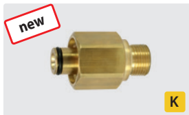
TR22 F : 3/8" M. Alternative to adapter 6. Brass. Max. 400 bar / 150° C.