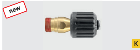
TR22 M : M22 F QSV. Brass. Swivel. Alternative to adapter 2+3. Max. 400 bar / 150° C.