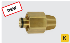
TR22 F : 3/8" F. Alternative to adapter 6. Brass. Max. 400 bar / 150° C.