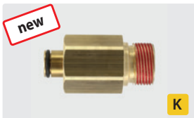
TR22 F : TR22 M. Brass. Max. 400 bar / 150° C.