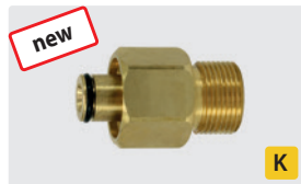
TR22 F : M22 M. Alternative to adapter 6. Brass. Max. 400 bar / 150° C.