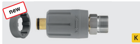
TR22 F : M22 M. Swivel. Brass. Alternative to adapter 12. Incl. 1 heat resistant cap. Max. 400 bar / 150° C.