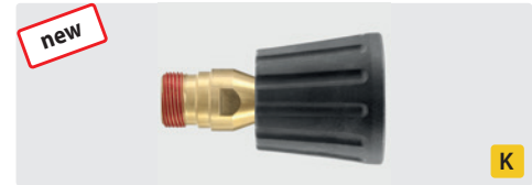
TR22 M : M 22 F QSV. Brass. Swivel. Alternative to adapter 2+3. Max. 400 bar / 150° C.