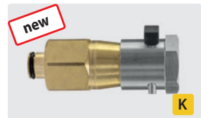
TR22 F : Plug coupling Ø 11 mm. Brass/stainless steel. Max. 400 bar / 150° C.