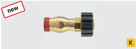
TR22 M : M22 F. Alternative to adapter 2+3. Brass. Max. 400 bar / 150° C.