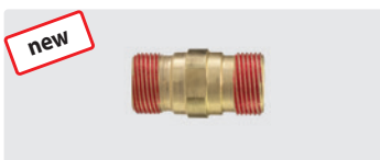
TR22 M. Alternative to adapter 9. Brass. Max. 400 bar.