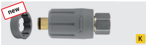
TR22 F : 3/8" F. Swivel. Brass. Alternative to adapter 12. Incl. 1 heat resistant cap. Max. 400 bar / 150° C.