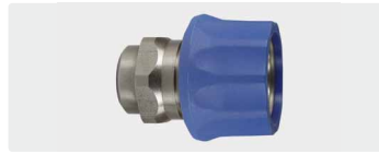
Coupling : F. Stainless steel. Max. 250 bar / 150 °C