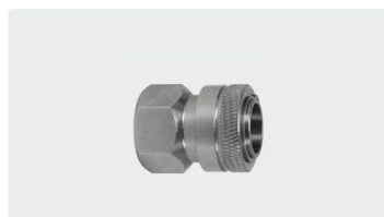
Coupling : F. Stainless steel. Max. 150 bar / 90 °C