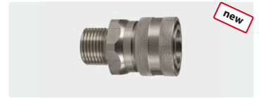
Coupling : M. Stainless steel. 60° cone. Max. 250 bar / 150 °C