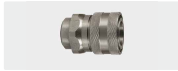
Coupling : F. Stainless steel. Max. 250 bar / 150 °C