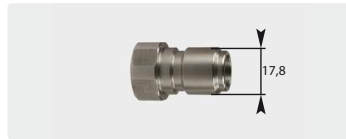
Plug : F. Stainless steel. Max. 250 bar / 150 °C