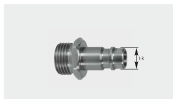
Plug : M. Stainless steel. Max. 150 bar / 90 °C