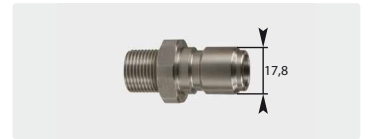
Plug : M. Stainless steel. 60° cone. Max. 250 bar / 150 °C