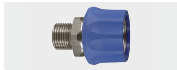
Coupling : M. Stainless steel. 60° cone. Max. 250 bar / 150 °C