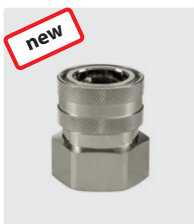
ST-45. Nickel-plated brass. Quick Coupling : 1" F. 25 bar / 90° C