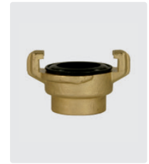
F thread. Flat seal. Brass