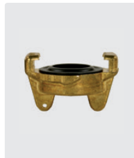
Bayonet blank coupling with gasket. Brass