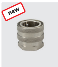
ST-45. Nickel-plated brass. Quick Coupling : 3/4" F. 25 bar / 90° C