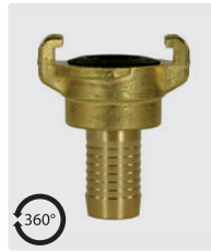
Swivel straight. Brass