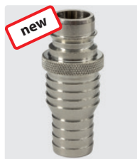
ST-45. Nickel-plated brass. Plug nipple with hose barb 19-25 mm. 25 bar / 90° C