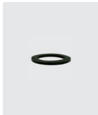
Flat seal. For F thread