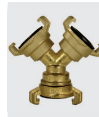
3-way bayonet coupling. Brass