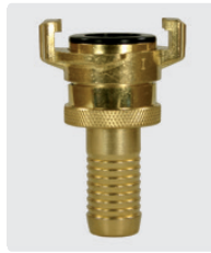
Suction coupling *. Brass