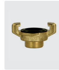
M thread. Brass