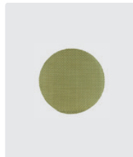
100 meshes/cm². Brass. Strainer insert. ⌀ 33 mm