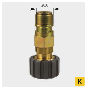
Plug : F. Zinc-plated steel + brass. Max. 250 bar / 150 °C