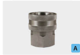
Coupling : F. Stainless steel. Max. 250 bar / 150 °C