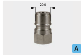
Plug : F. Stainless steel. Max. 250 bar / 150 °C