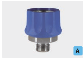
Coupling : M. Stainless steel. Max. 250 bar / 150 °C