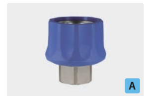
Coupling : F. Nickel-plated brass. Max. 250 bar / 150 °C