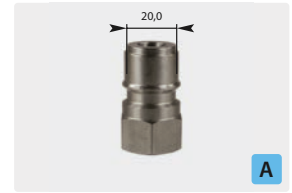
Plug : F. Hardened stainless steel. Max. 250 bar / 150 °C