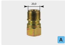
Plug : F. Zinc-plated steel. Max. 250 bar / 150 °C