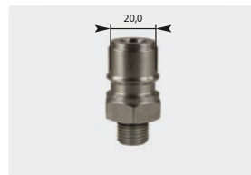
Plug : M. Hardened stainless steel. Max. 250 bar / 150 °C