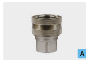
Coupling : F. Nickel-plated brass. Max. 250 bar / 150 °C