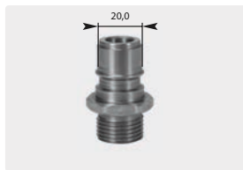
Plug : M. Stainless steel. Max. 250 bar / 150 °C