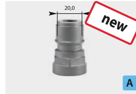
Plug : F. Hardened stainless steel. Max. 250 bar / 150 °C