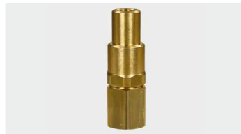
1/4" F : 1/2" F. Brass. Max. 250 bar / 90 °C