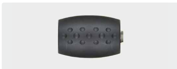
1/4" F : 1/4" M. 350 bar. Stainless