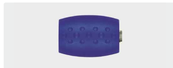
1/4" F : 1/4" M. 350 bar. Stainless. easywash365+ blue