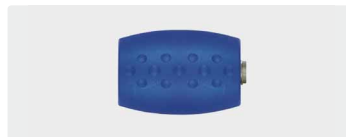
1/4" F : 1/4" M. 350 bar. Stainless. RAL 5005