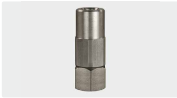
1/4" F : 3/8" F. Stainless steel. Swivel with radial friction bearing. Max. 350 bar / 90 °C