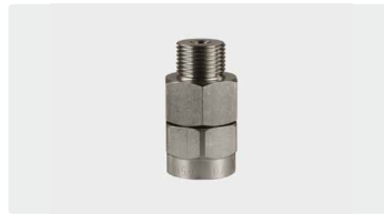
3/8" M : 3/8" F. Stainless steel. Max. 500 bar / 90 °C