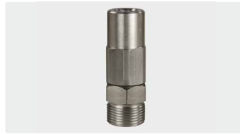
1/4" F : M22 M. Stainless steel. Swivel with radial friction bearing. Max. 350 bar / 90 °C