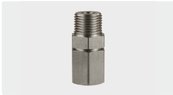
1/2" M : 1/2" F. Stainless steel. Max. 350 bar / 90 °C