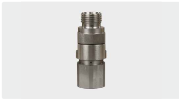
1/2" M : 1/2" F. Max. 600 bar