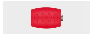
1/4" F : 1/4" M. 350 bar. Stainless