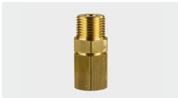
1/2" M : 1/2" F. Brass. Max. 250 bar / 90 °C