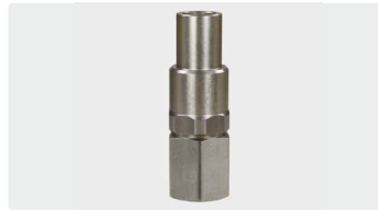
1/4" F : 1/2" F. Stainless steel. Max. 350 bar / 90 °C