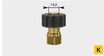
M22 F : F. Max. 400 bar / 150 °C