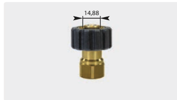
M22 F : F. Max. 400 bar / 150 °C