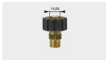
M22 F : F. Max. 400 bar / 150 °C