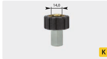
M22 F : F. Max. 400 bar / 150 °C