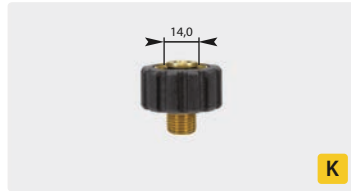
M22 F : M. Max. 400 bar / 150 °C