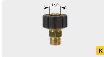
M22 F : M. Max. 400 bar / 150 °C