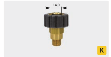
M22 F : M. Max. 400 bar / 150 °C