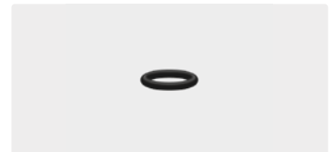
O-ring. Quick screw coupling US. 10.77 x 2.62. NBR 70