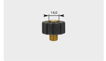
Short M22 : M. Black. Max. 400 bar / 150 °C