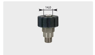
M22 : M. Stainless steel. Max. 500 bar