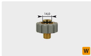
Short M21 : M. Grey. Max. 400 bar / 150 °C