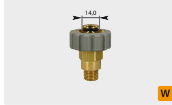
Standard M21 : M. Grey. Max. 400 bar / 150 °C