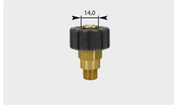
Standard M22 : M. Black. Max. 400 bar / 150 °C