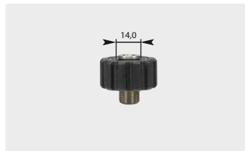
Short M22 : M. Stainless steel. Max. 400 bar / 150 °C