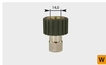
M21 F : F. Max. 250 bar / 120 °C