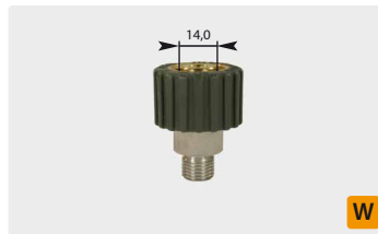
M21 F : M. Max. 250 bar / 120 °C