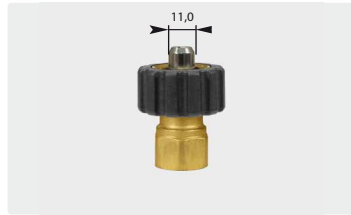
1/2" F : F. Max. 300 bar / 150 °C