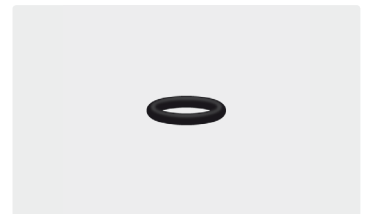
O-ring Swivel MSM