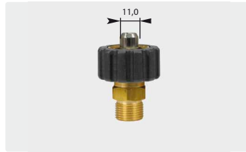
1/2" F : M. Max. 300 bar / 150 °C