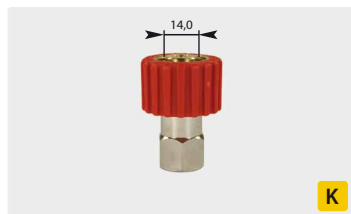
M22 F : F. Max. 250 bar / 120 °C