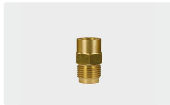
F : 1/2" M. Max. 300 bar / 150 °C