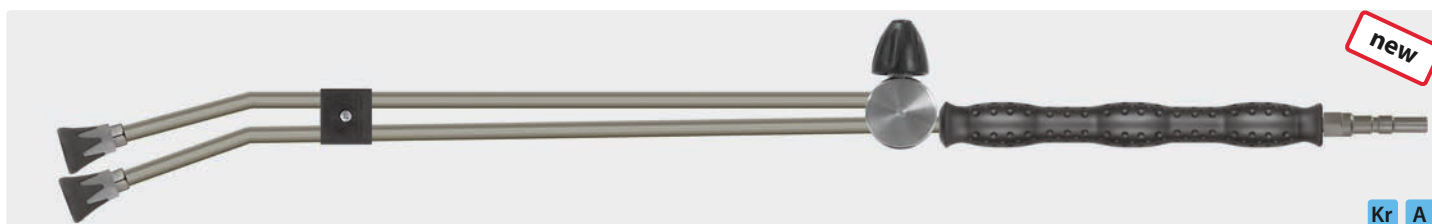
Plug KW. Lance with moulded handle ST-28 Cool & Compact, valve ST-53.2 on top and nozzle protector ST-10 with low pressure nozzle & thread 1/4" F. Max. 400 bar / 150 °C