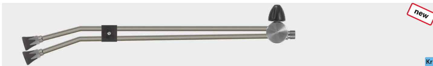
M22 M. Lance with valve ST-53.2 on top and nozzle protector ST-10 with low pressure nozzle. Max.400 bar / 150 °C