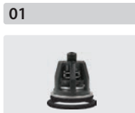
Valves 6 pieces