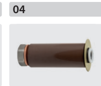
Ceramic socket kit for 3 pistons