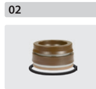
Seal kits for 3 pistons