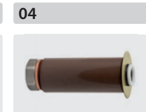
Ceramic socket kit for 3 pistons