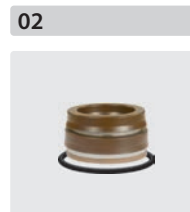
Seal kits for 3 pistons