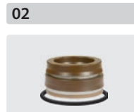
Seal kits for 3 pistons