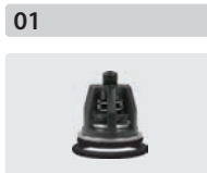
Valves 6 pieces