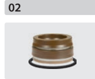
Seal kits for 3 pistons