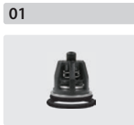
Valves 6 pieces