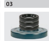
Oil seal kits