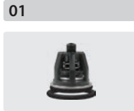
Valves 6 pieces