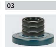
Oil seal kits