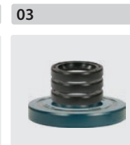
Oil seal kits (7 pieces)