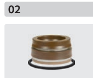
Seal kits for 3 pistons