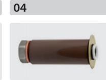
Ceramic socket kit for 3 pistons