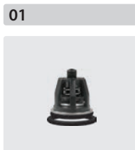
Valves 6 pieces