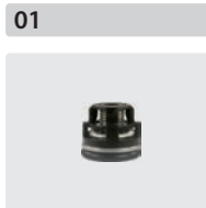
Valves 6 pieces