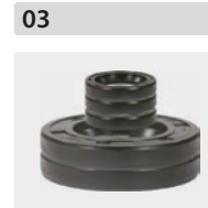
Oil seal kits