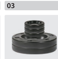
Oil seal kits (6 pieces)