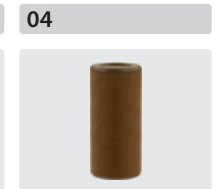
Ceramic sockets for 3 pistons