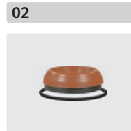
Seal kits for 3 pistons