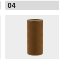
Ceramic sockets for 3 pistons