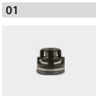
Valves 6 pieces