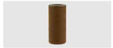
Ceramic socket 1 piece