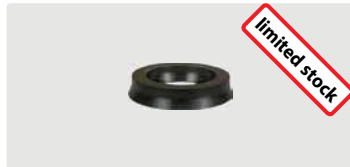
Seal kit for 1 piston