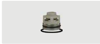
Valves 6 pieces