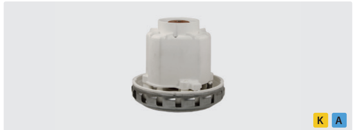
1 stage. 230 V / 50 Hz. Cable type 1 enclosed