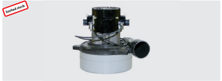
2 stage with waste air pipe. 24 V. Cable pre-installed