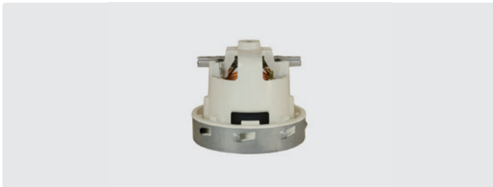
1 stage. 230 V / 50 Hz. Without cable, (Cable type 1 optional)