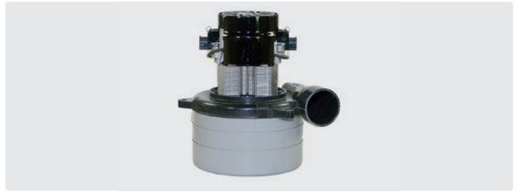
3 stage with waste air pipe. Cable pre-installed. 262 064 113 : 24/50 Hz. 262 074 113 : 36/50 Hz