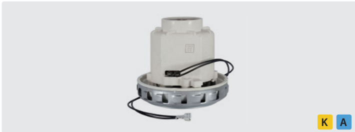
1 stage. 230 V / 50 Hz. Cable pre-installed