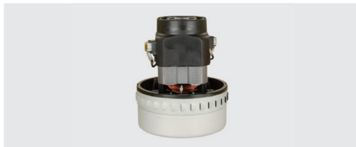
2 stage. 230 V / 50 Hz. Cable pre-installed