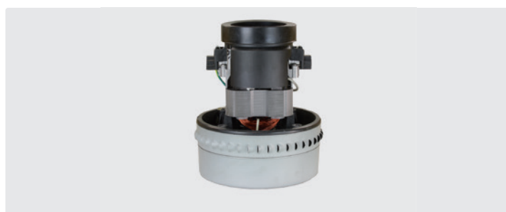
2 stage. 230 V / 50 Hz. Cable pre-installed