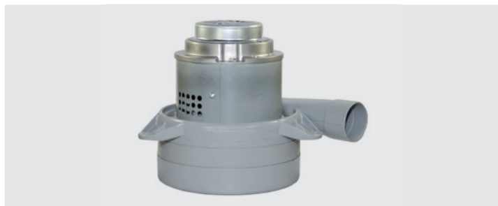
3 stage with waste air pipe. 230 V / 50 Hz. Cable pre-installed