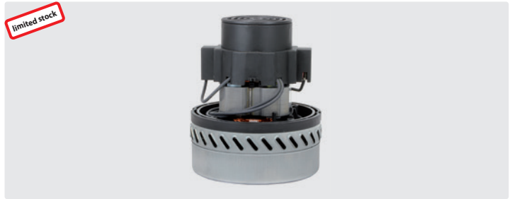
2 stage. 24 V. Cable pre-installed