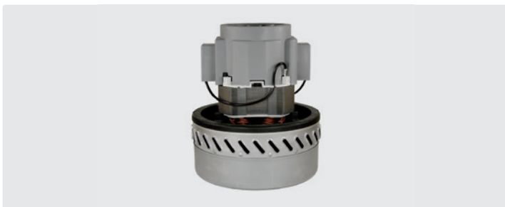
2 stage. 230 V / 50 Hz. Cable type 2 enclosed