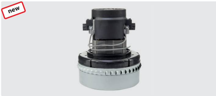
2 stage. 230 V / 50 Hz. Cable type 1 enclosed