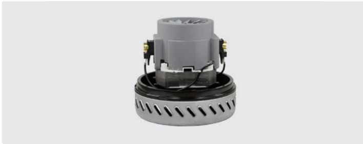
1 stage. 230 V / 50 Hz. Cable type 2 enclosed