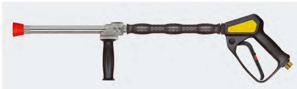
3/8" F. Stainless steel. Longcast lance 350 mm with insulation ST-29 Cool & Compact 330 mm, gun ST-2300, grip aside and nozzle protector made out of plastic without nozzle. Max. 280 bar / 45 l/min / 100 °C