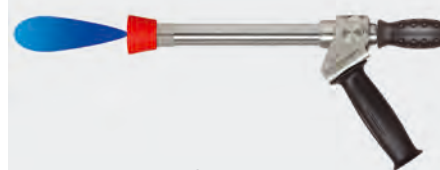
progressive, conical spray jet