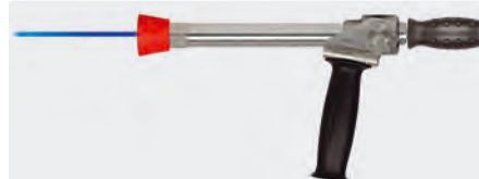
long casting full jet