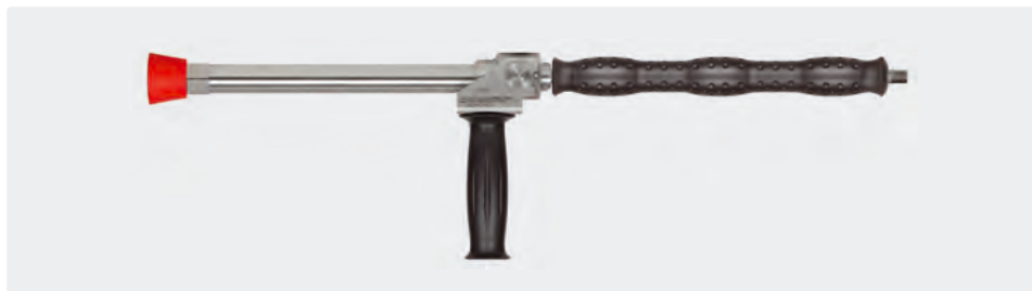
1/4" M. Stainless steel. Longcast lance 350 mm with insulation ST-29 Cool & Compact 330 mm, grip aside and nozzle protector made out of plastic without nozzle. Max. 280 bar / 130 l/min / 100 °C