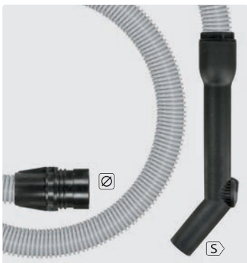
(265 054 + 263 253)