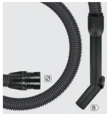
(265 054 + 263 653)