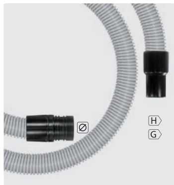
(265 053 + 264 051)