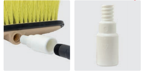
Adaptor for lances without coarse thread. Coarse thread F: thread M