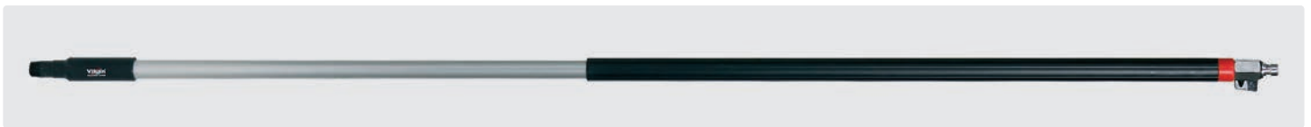
Aluminium handle. Ergonomic handle with insulated grip and ball valve. Connector suitable for Nito system