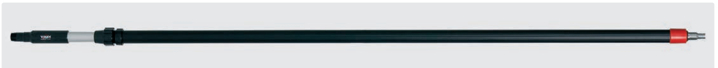
Aluminium handle. Telescopic handle with insulated grip. Hose tail suitable for 1/2" and 3/4" hose