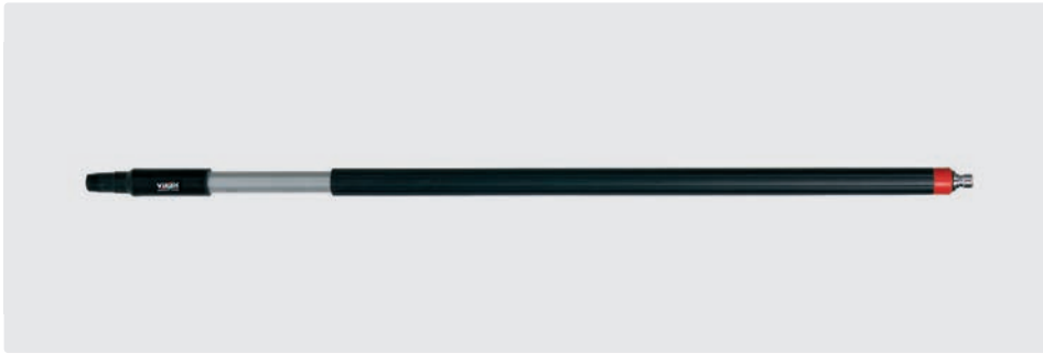
Aluminium handle. Ergonomic handle with insulated grip. Connector suitable for Nito system