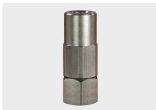
1/4" F : 3/8" F