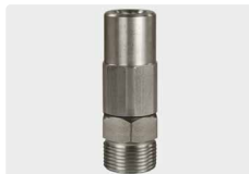
1/4" F : M22 M