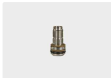
Repair kit ST-311