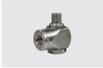
1/4" F : 1/4" M. DN 6. Max. 400 bar / 30 r.p.m. / 90 °C