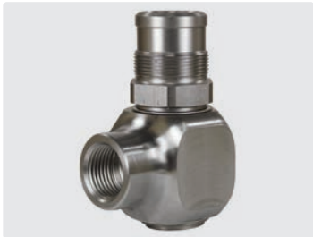
M28 M. DN 12. For series R+M 434 - R+M 564. Max. 300 bar / 30 r.p.m. / 90 °C