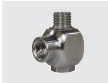
1/2" F : 1/2" M. DN 12. Max. 300 bar / 30 r.p.m. / 90 °C