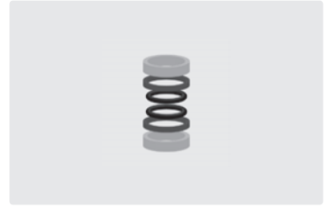
Repair kit swivels ST-320