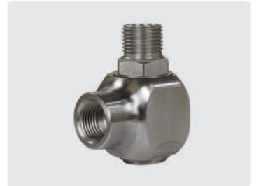
1/2" F : 1/2" M. DN 12. Max. 300 bar / 30 r.p.m. / 90 °C