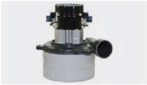
3 stage with waste air pipe. Cable pre-installed. 262 064 113 : 24/50 Hz. 262 074 113 : 36/50 Hz