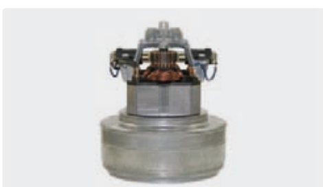
2 stage. 230 V / 50 Hz. Cable pre-installed