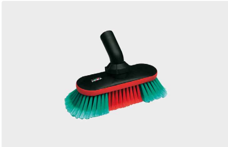
Wash brush swivelling

Brush with swivel. The inclined/slanted bristles ensure that all corners can be reached. With connection for aluminum handles. Bristles 50 mm