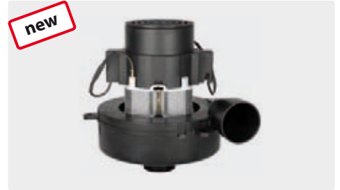
2 stage with waste air pipe and base. 230 V / 50 Hz. Cable type 3 enclosed