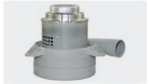
3 stage with waste air pipe. 230 V / 50 Hz. Cable pre-installed