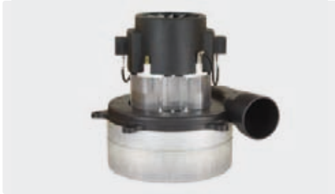
2 stage with waste air pipe. 230 V / 50 Hz. Cable pre-installed