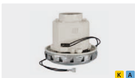
1 stage. 230 V / 50 Hz. Cable pre-installed