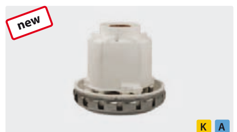
1 stage. 230 V / 50 Hz. Cable type 1 enclosed