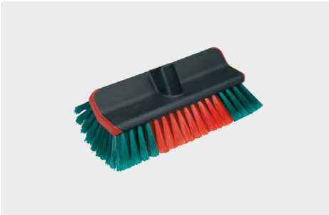
High-low wash brush

The form of the brush allows the bristles to be in constant contact with the surface. The brush is equipped with a rubber edge. With connection for aluminum handles. Bristles 50 mm