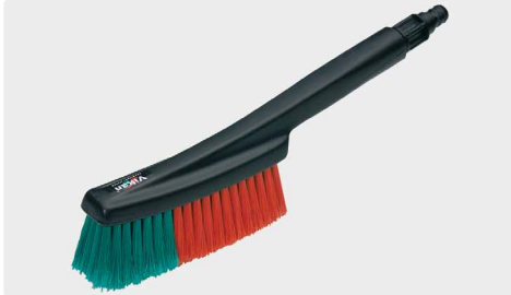
Hand wash brush

Brush with integrated water flow. Connection suitable for Gardena system. Ideal for smaller cleaning applications. Bristles 50 mm