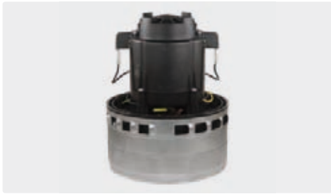
3 stage. 230 V / 50 Hz. Cable pre-installed