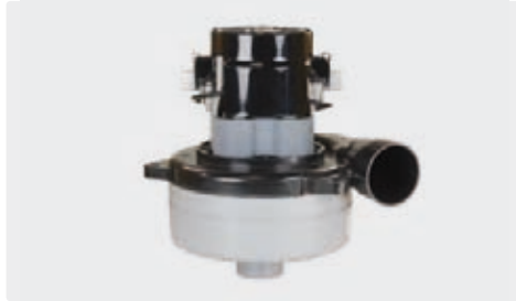
2 stage with waste air pipe and base. Voltage: 24 V. Cable pre-installed