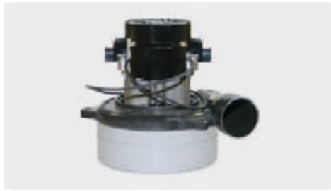
2 stage with waste air pipe. 24 V. Cable pre-installed