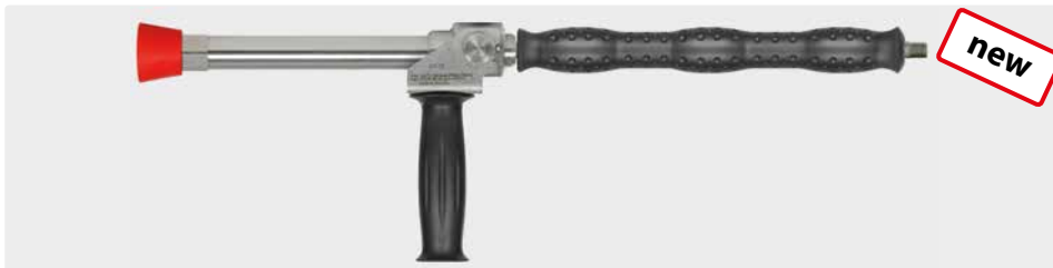
1/4" M. Stainless steel. Longcast lance 300 mm with vented handle ST-29 Cool & Compact 330 mm, grip aside and nozzle protector made out of plastic without nozzle. Max. 280 bar / 130 l/min / 100 °C