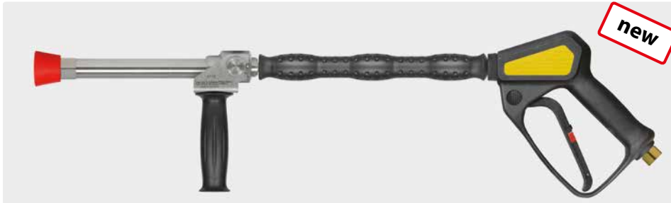
3/8" F. Stainless steel. Longcast lance 300 mm with vented handle ST-29 Cool & Compact 330 mm, gun ST-2300, grip aside and nozzle protector made out of plastic without nozzle. Max. 280 bar / 45 l/min / 100 °C