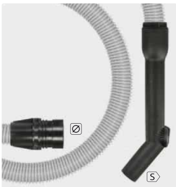
(265 054 + 263 253)