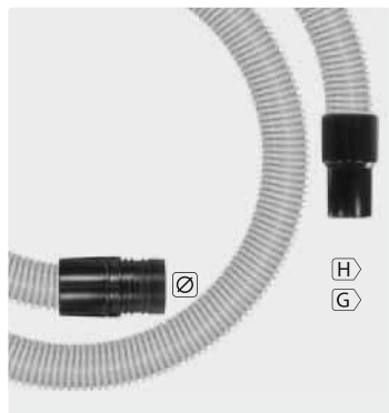
(265 053 + 264 051)