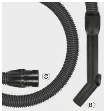
(265 054 + 263 653)