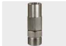
1/4" F : M22 M