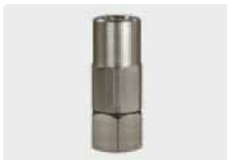
1/4" F : 3/8" F