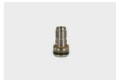
Repair kit ST-311