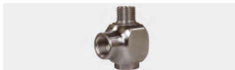
1/2" F : 1/2" M. DN 12. Max. 30 r.p.m. / 90 °C