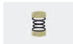
Repair kit swivel ST-322